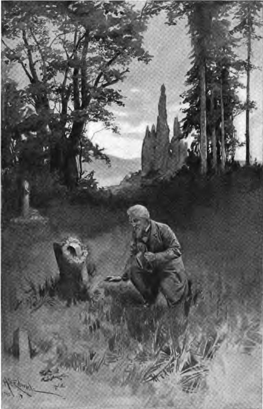
"HE BENT AND STROKED THE HUMBLE MOUNDS, WITH KIND, OLD-FASHIONED WORD."